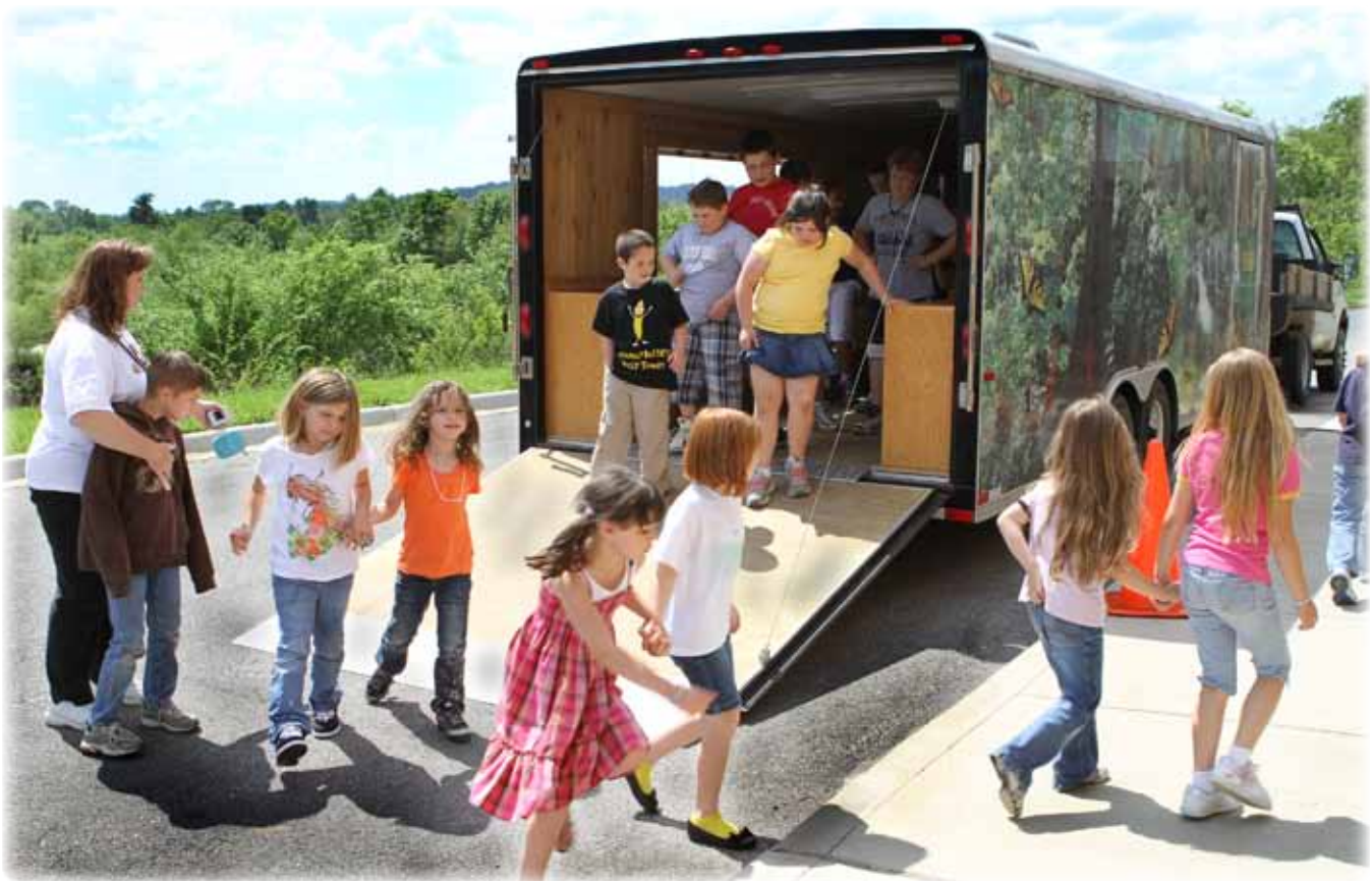
Children from the Heritage Elementary School in Shelby County exit the Environmental Education Center's mobile unit.